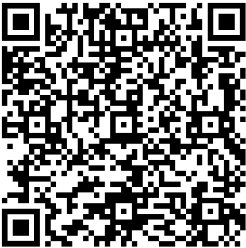
Varsity Google Form