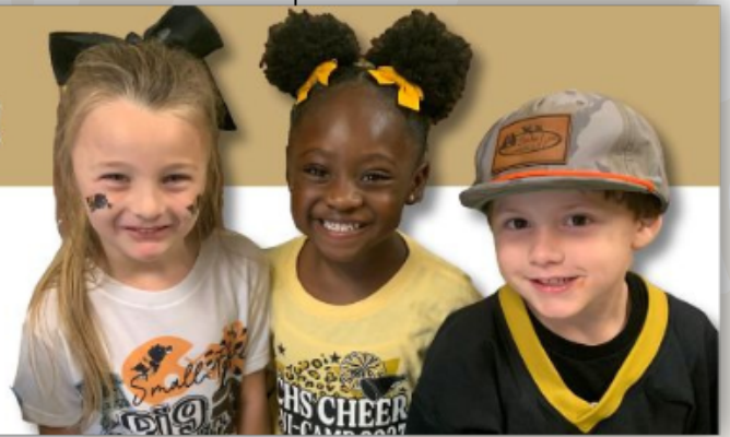
Click image above for details